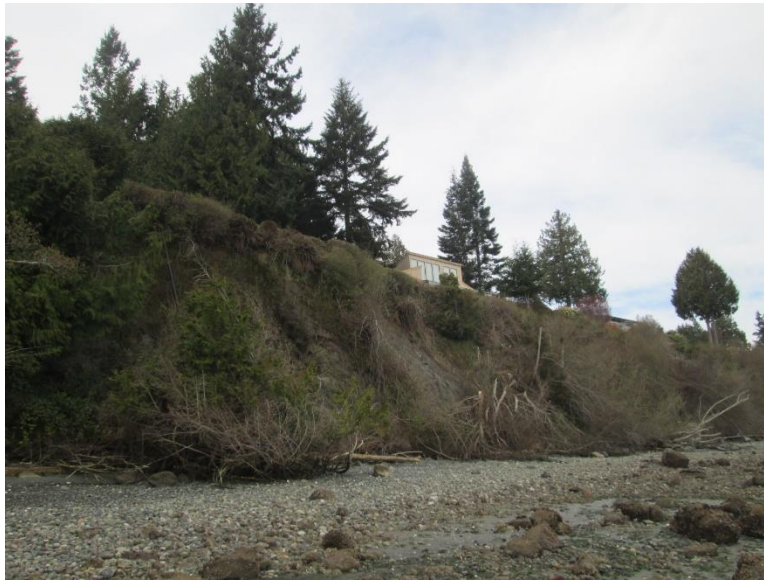
Bluff Erosion and Tree Topping

Several locations of severe bluff erosion and extensive tree topping/cutting were identified on the beach as shown in the following pictures.