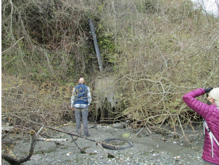
Pope Way Outfall – April 1, 2021