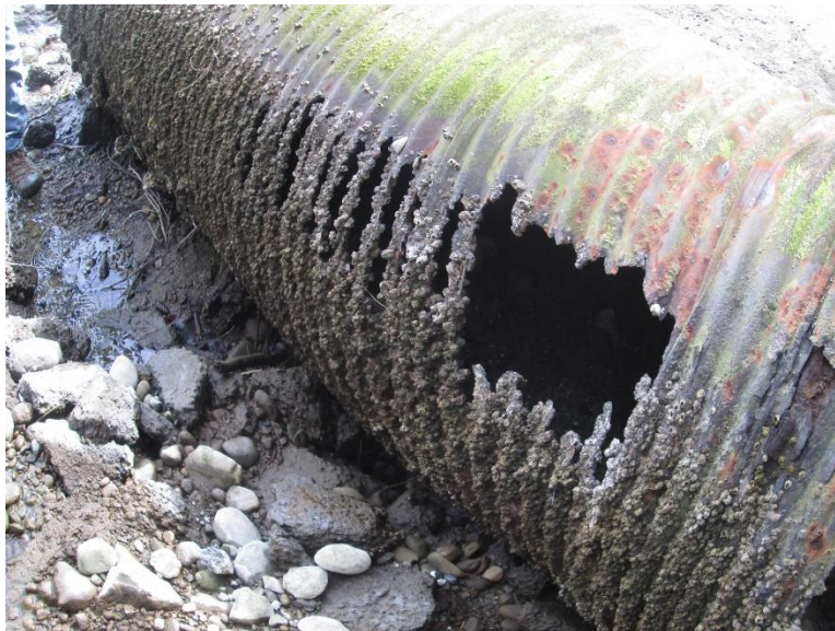
Detached Portion of Oak Bay Outfall Pipe – April 1, 2021

The attached figures show the locations of the outfalls.