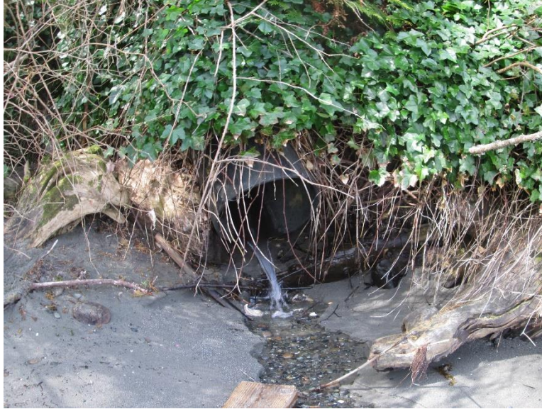
Montgomery Court Outfall – April 1, 2021 (Between 192 and 200 Montgomery Court)