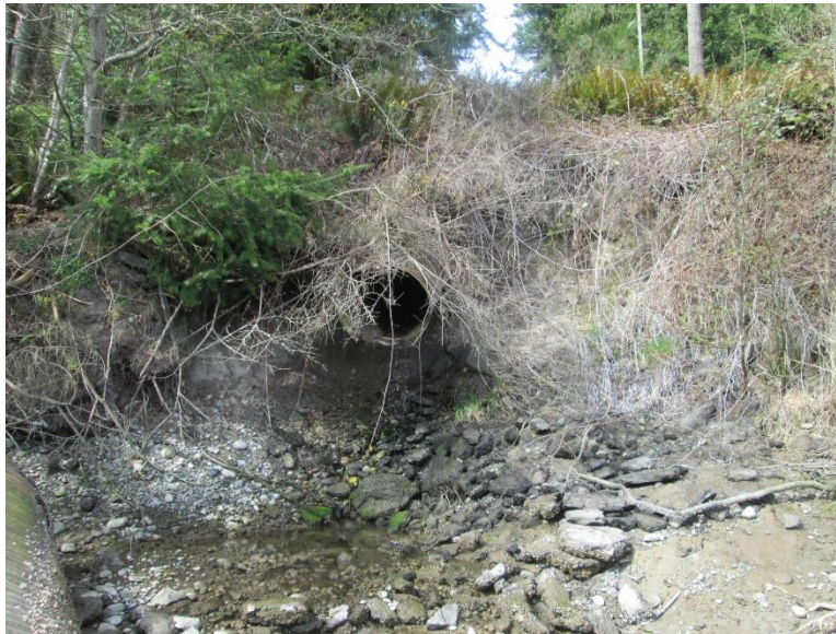
Oak Bay Outfall – April 1, 2021

also appears to have areas of corrosion on the bottom of the pipe. The soil under the remaining pipe is eroded.