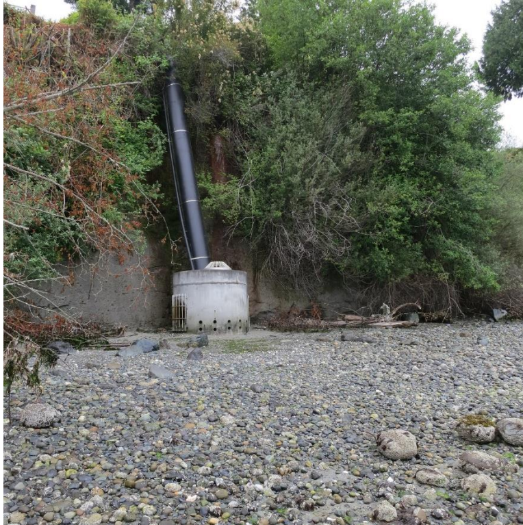
Libby Court Outfall – July 13, 2017

This 18-inch diameter HDPE outfall was identified on the 2017 beach walk. The outfall was not previously known to the District. The Ludlow Maintenance Committee (LMC) does not have any information regarding who installed the culvert or when it was installed. It appears that flow from Basin E1 (northeast end of Jackson Lane) and Oak Bay Road is conveyed between 81 and 101 Montgomery Court and is discharged along with flow from Basin E2 (Montgomery Court north from Montgomery Lane) to a catch basin in front of 81 Montgomery Court then into the outfall. The culvert pipe appears to have been installed below grade on the LMC parcel. The condition of the pipe at the outfall is excellent and has not changed since 2017. There is no indication of erosion or potential for damage to the outfall at the beach.