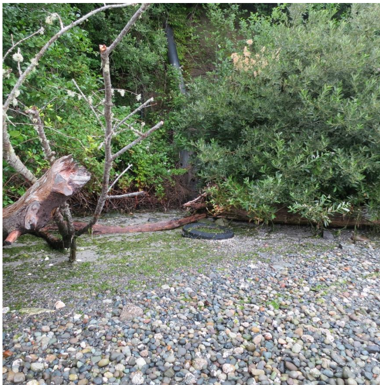
Pope Way Outfall – July 13, 2017 (Outfall Structure Behind Driftwood and Vegetation)