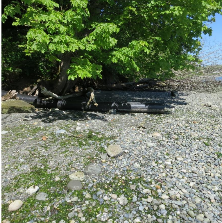
Montgomery Court Outfall – May 23, 2017 (Between 70 and 120 Montgomery Court)

This 18-inch diameter HDPE outfall collects drainage from Basin C2 in the north portion of the District (gully between Jackson and Foster Lanes, Oak Bay Road, and the north end of Montgomery Court). This culvert was installed by homeowners on an LMC parcel. The outfall was designed by Dick Reagan, P.E. The outfall daylights at the top of the bank between 192 and 200 Montgomery Court in a thickly wooded area and appears to continue above grade to the beach. The condition of the pipe at the outfall is excellent. There is no indication of erosion or potential for damage to the outfall at the beach. The condition of the outfall has not changed since 2017.