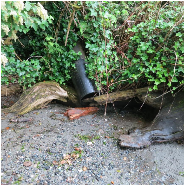
Montgomery Court Outfall – July 13, 2017 (Between 192 and 200 Montgomery Court)