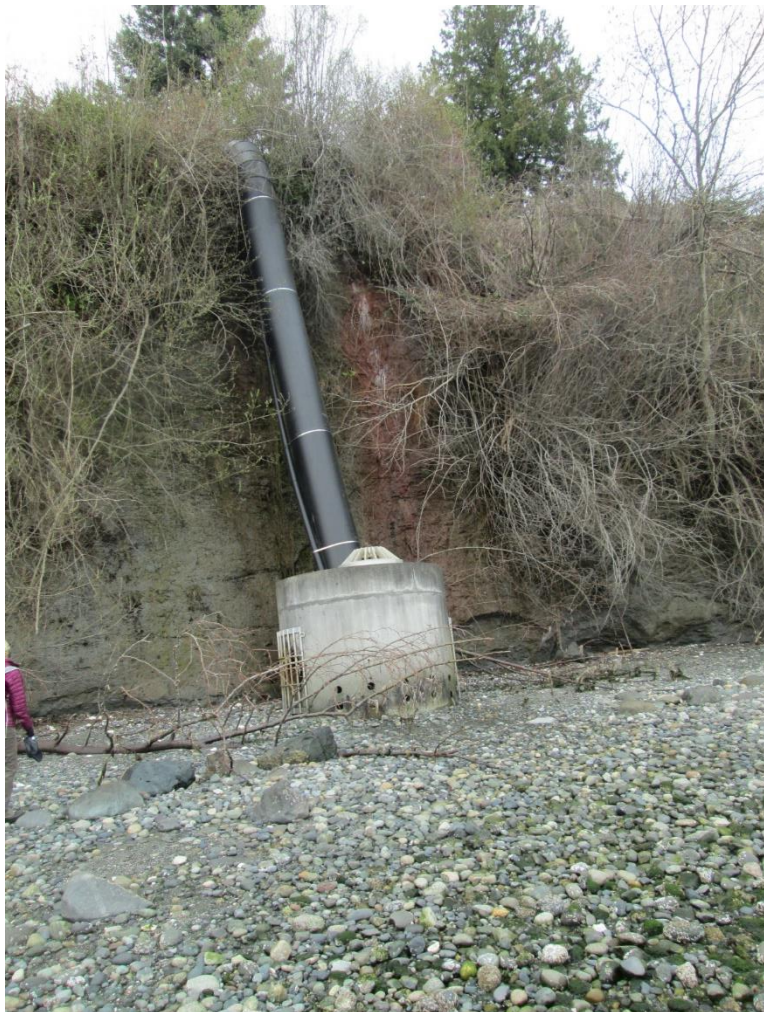
Libby Court Outfall – April 1, 2021

The Libby Court outfall structure was constructed in 2004. The structure consists of a 32-inch diameter HDPE overbank discharge pipe and a 60-inch diameter concrete catch basin/diffuser structure on the beach adjacent to the bluff. The outfall structure including overbank pipe is in good condition. The condition of the beach at the base of the structure has not changed significantly since 2017. The structure does not need cleaning at this time. The bank immediately behind the overbank pipe and outfall structure does not appear to have changed significantly since 2017.