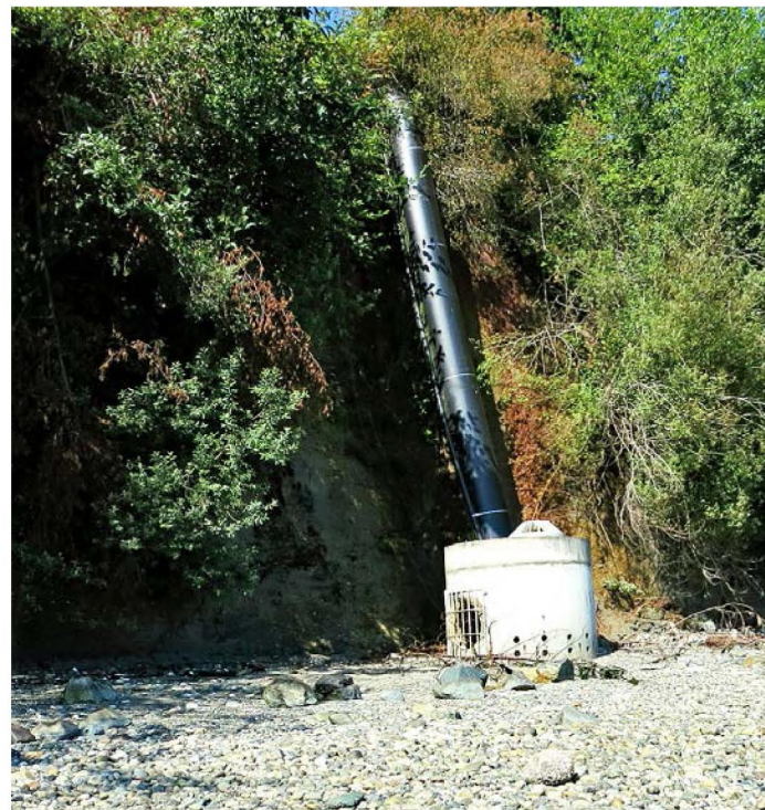
Libby Court Outfall.

The District completed the Libby Court Outfall in 2004. The district installed a 30-inch diameter storm pipe from Montgomery Lane to a concrete diffuser structure located on the beach. The pipe transitions from underground to above ground at the face of the bluff.