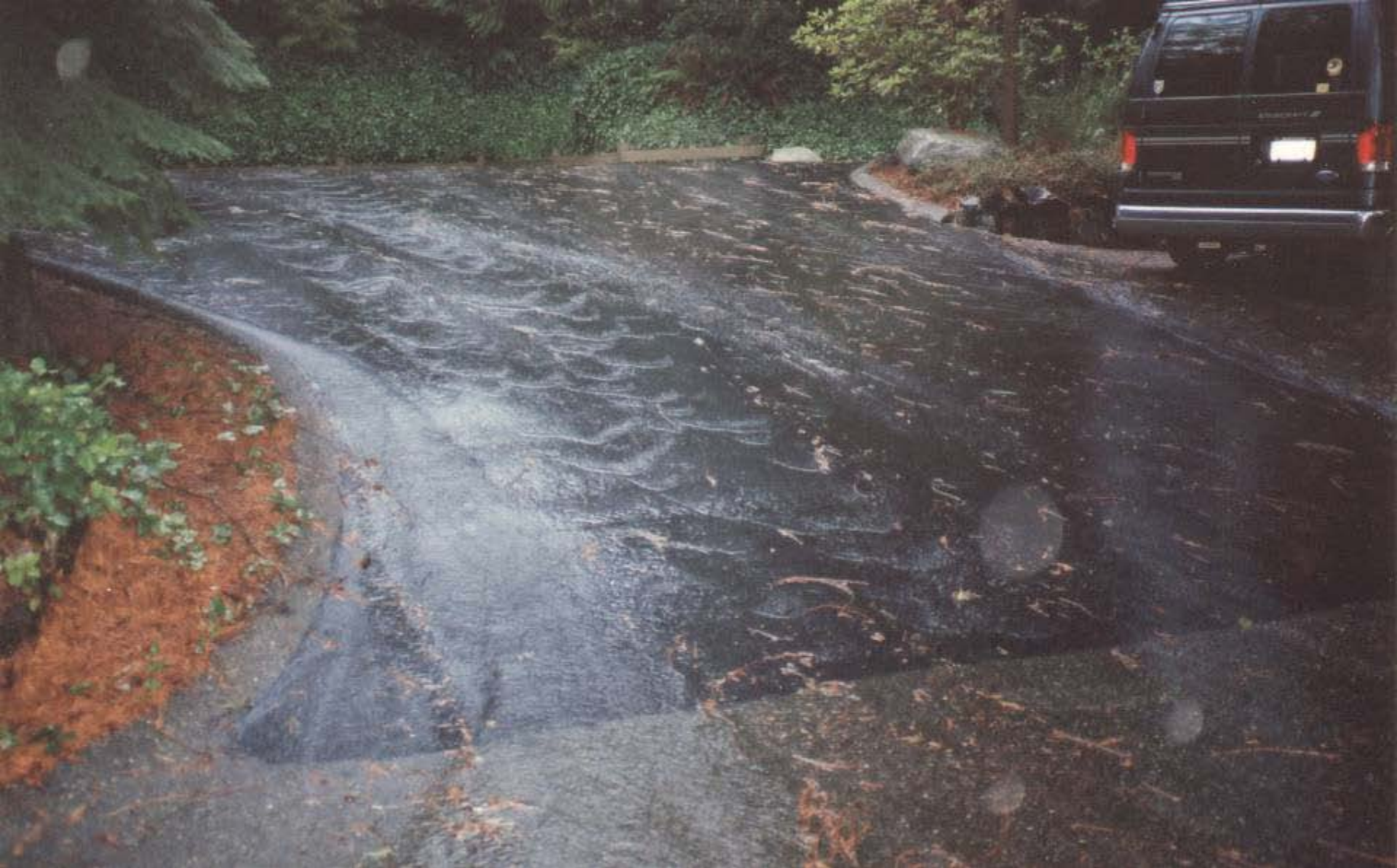
North Bay No. 2 Condominium – Drainage from Oak Bay Road