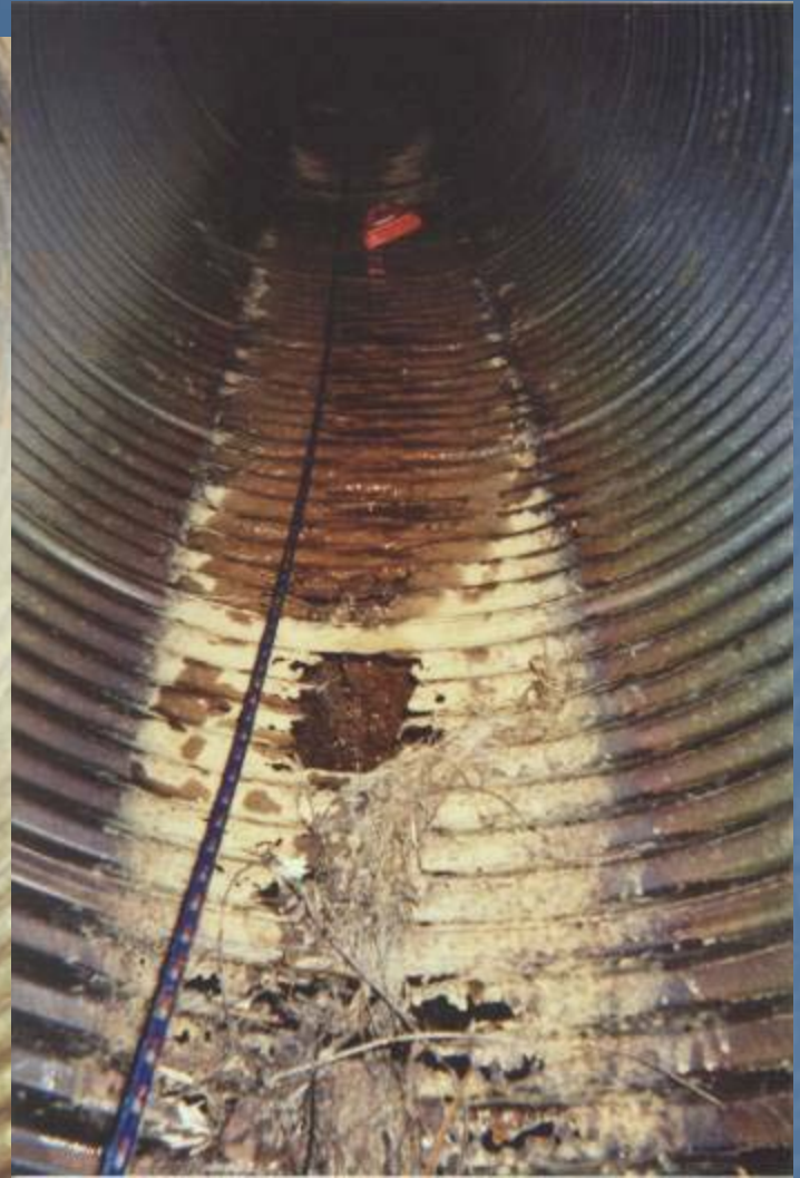
Libby Court Outfall